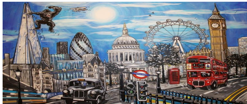
Jenny Leonard— Collage/ Mixed Media

You can choose one of the artists listed on this page or one of your own. Remember: - you must only choose imagery that relate to 'Best of British'