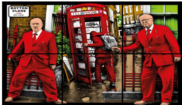
Gilbert & George – Collage