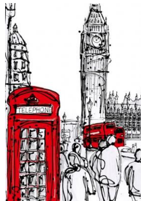
Oscar Wilson Typography