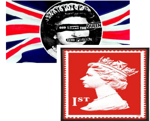
Jamie Reid collage